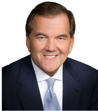
Governor Tom Ridge